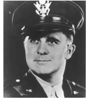
Rev Clark V. Poling

On December 19, 1944, all four chaplains were posthumously awarded the Purple Heart and the Distinguished Service Cross.