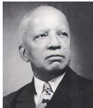
Carter G. Woodson

Black History Month was established in 1976 by Afro-Americans for the Study of Afro-American Life and History .