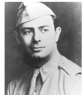
Rabbi Alexander D. Goode